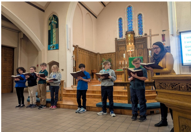
4 th grade leading chapel service