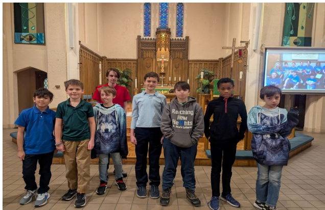
Lego Robotics Team placed 6 th place at competition