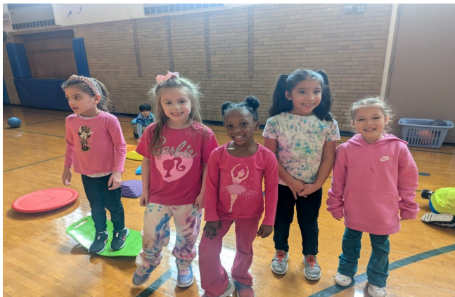
Kindergarten gym class